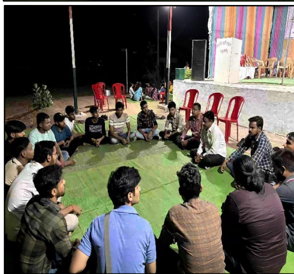
RATRI BHOJ & SAMIKSHA BAITHAK