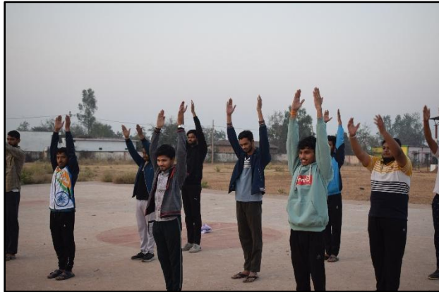
YOGA & P.T. SESSION